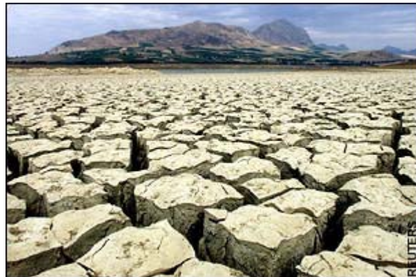
Biblical droughts, floods, plagues and extinctions?

Last week, Gordon Brown and his chief economist both said global warming was the worst "market failure" ever. That loaded sound-bite suggests that the "climate-change" scare is less